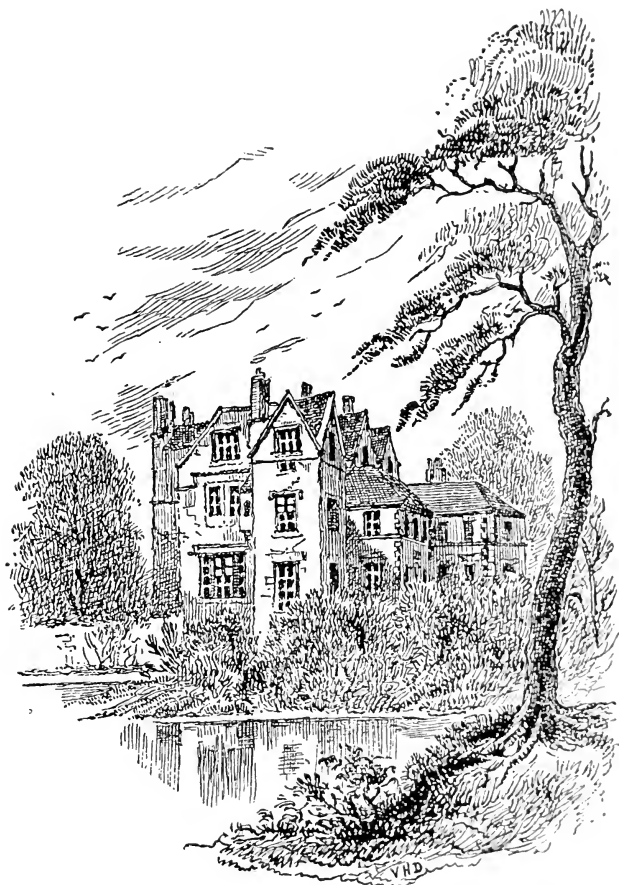
BREADSALL PRIORY, WHERE ERASMUS DARWIN DIED.